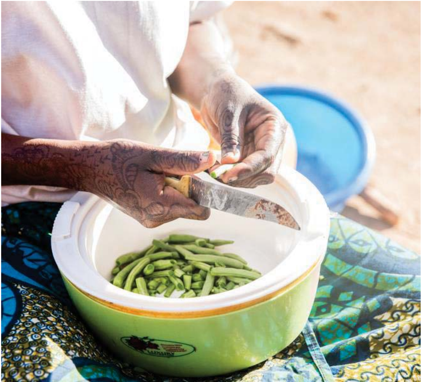
Female returnee in Niger